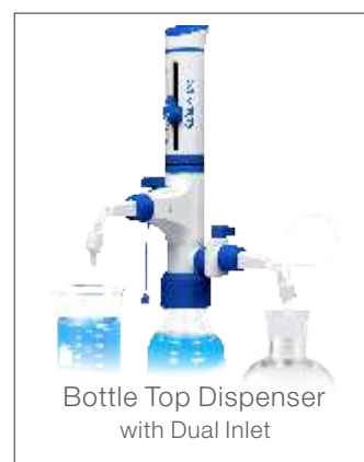
Bottle Top Dispenser with Dual Inlet

Fisherbrand™ offers three lines of bottle top dispensers which caters to every laboratory need from simple dispensing to handling of aggressive and hazardous chemicals and reagents. Fisherbrand dispensers are robust in design with a PTFE piston for smooth movement, easy volume setting, high chemical compatibility and an adjustable delivery nozzle for ease of working in challenging laboratory conditions. These dispensers are fully autoclavable and have easy user re-calibration.