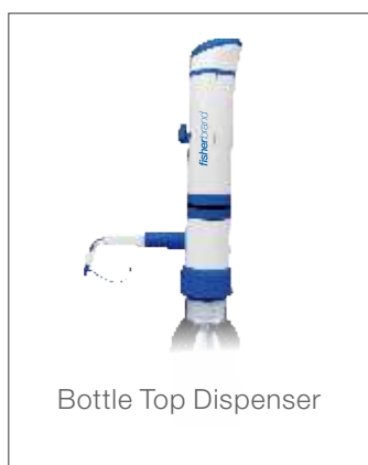
Bottle Top Dispenser